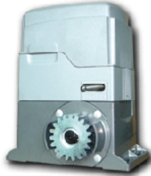
Mechanical limit switch (FL-IZ-I)