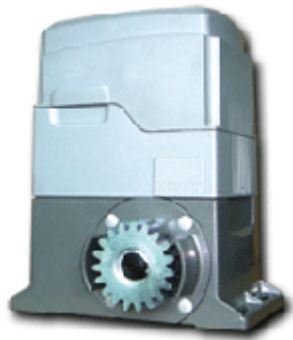
Magnetic limit switch FL-IZ-II